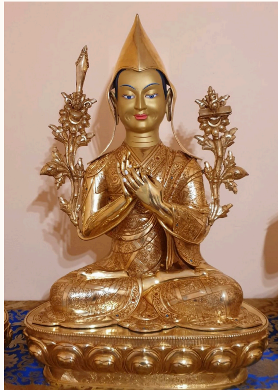
Statue of Lama Tsongkhapa at Maitreya Pure Land.

To mark this occasion, we are delighted to welcome our Kalmyk brothers and sisters , represented by the ADKF association (Association of the Kalmyk of France), to Nalanda Monastery for two days. They follow the same Gelug traditions as us, and for them, this day marks the start of the New Year.